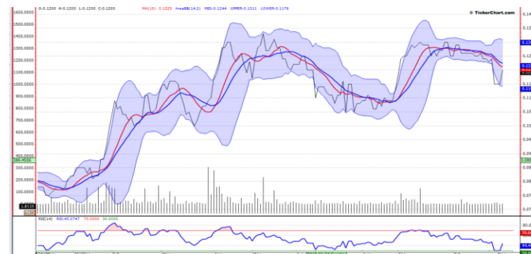
Support, Resistance and Target levels for U Capital OMAN 20 INDEX Co. - Weekly Basis

In line with U Capital technical analysis, the stock now in upward trend and the rectangle indicator will be complete after crossing a resistance level of OMR 0.120. The level of RSI below 30 points. The stock already cross the MA50, but if the stock comes out this channel, the target price will be at OMR 0.130.