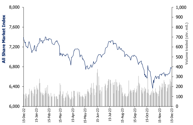
Index Performance relative to Volume