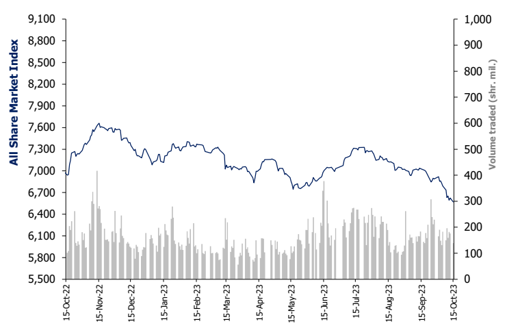
Index Performance relative to Volume