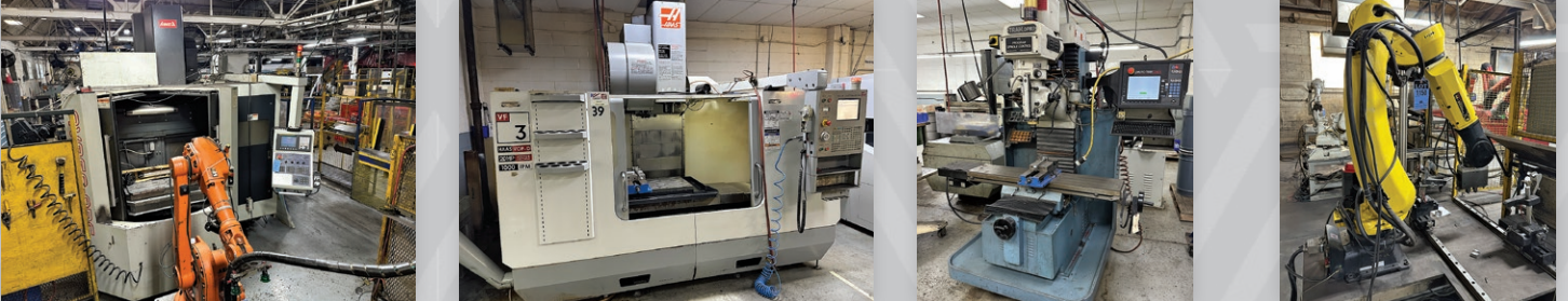
CNC Machinery: VMCs, HMCs, Mills