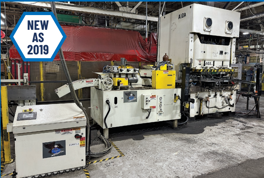
(4) AIDA Two-Point Gap Frame Presses

INSPECTION: Tuesday, December 3rd from 9:00 AM to 4:00 PM CT