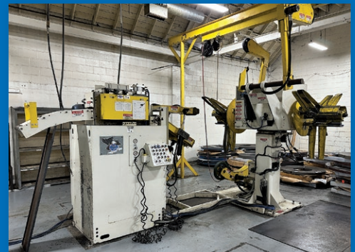
$1M in HD Feed Equipment