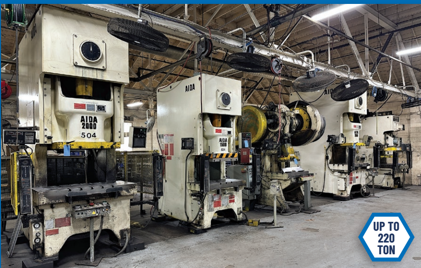
(10+) AIDA Single-Point Gap Frame Presses