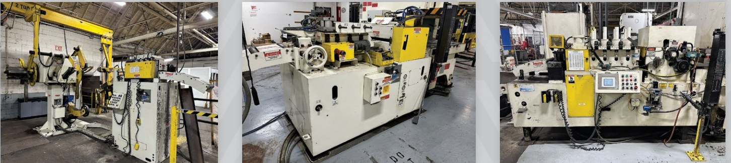
Feed Equipment: Uncoilers, Straighteners, Feeders as New as 2015