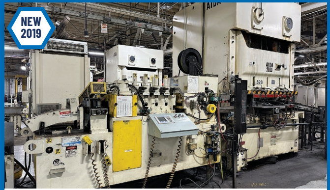
Major Stamping Facility: (15+) Aida Presses & HD Feed Equipment

CIA-INDUSTRIAL.COM 2020 DUNLAP ST. CINCINNATI, OH 45214 513.241.9701