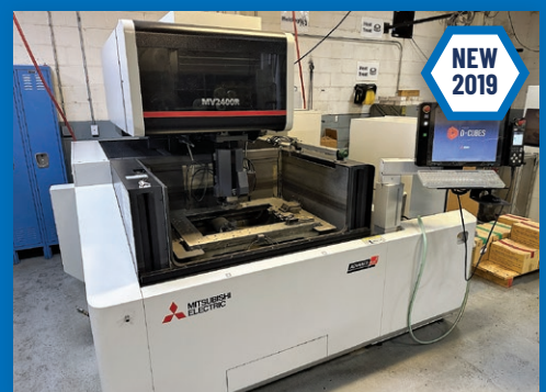
Mitsubishi 2400R EDM